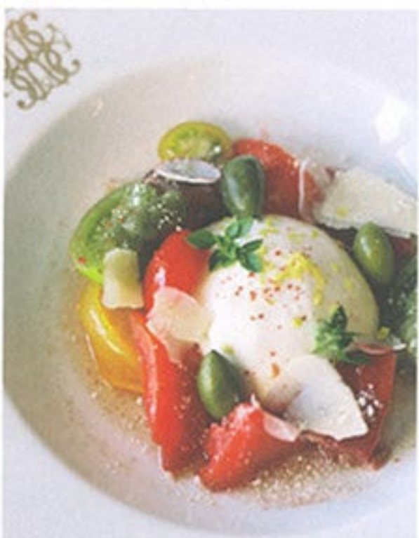
An Evening at La Bastide de Gordes